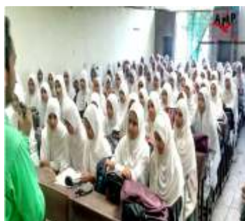
Anjuman Ishat Islam Urdu School Jalna, Maharashtra