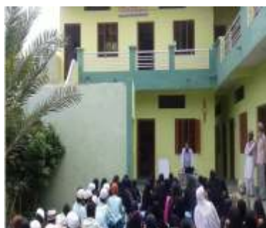
IQRA HIGH SCHOOL, Barwani, Madhya Pradesh