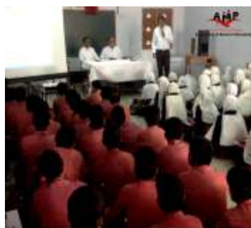
F.D. High School, Ahmedabad, Gujarat