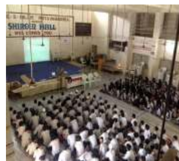
Madarsa Islamiya High School, Motavarchha Surat, Gujarat